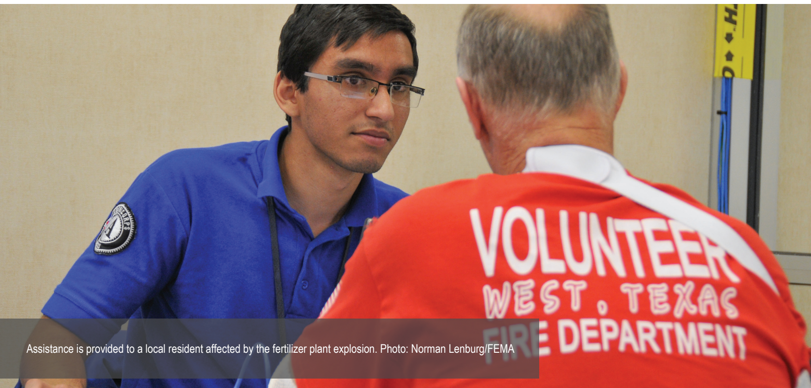
Assistance is provided to a local resident affected by the fertilizer plant explosion.