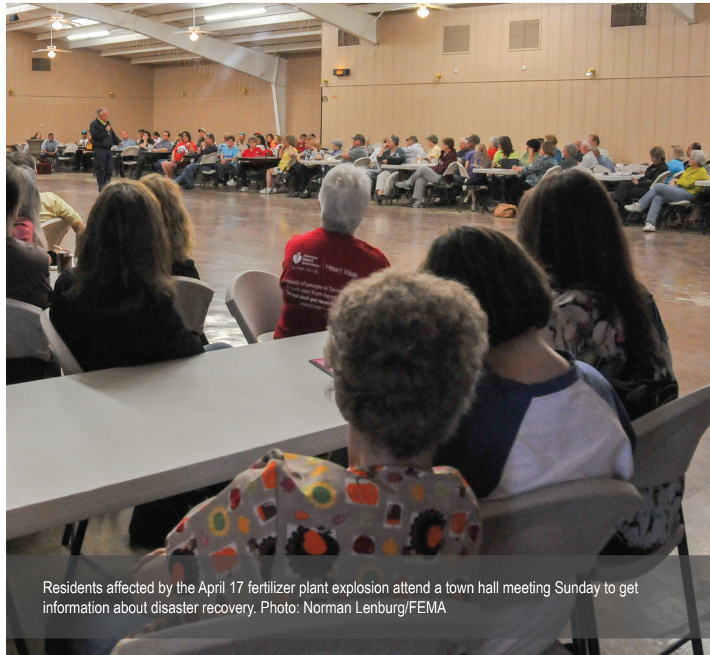
Residents affected by the April 17 fertilizer plant explosion attend a town hall meeting Sunday to get information about disaster recovery.