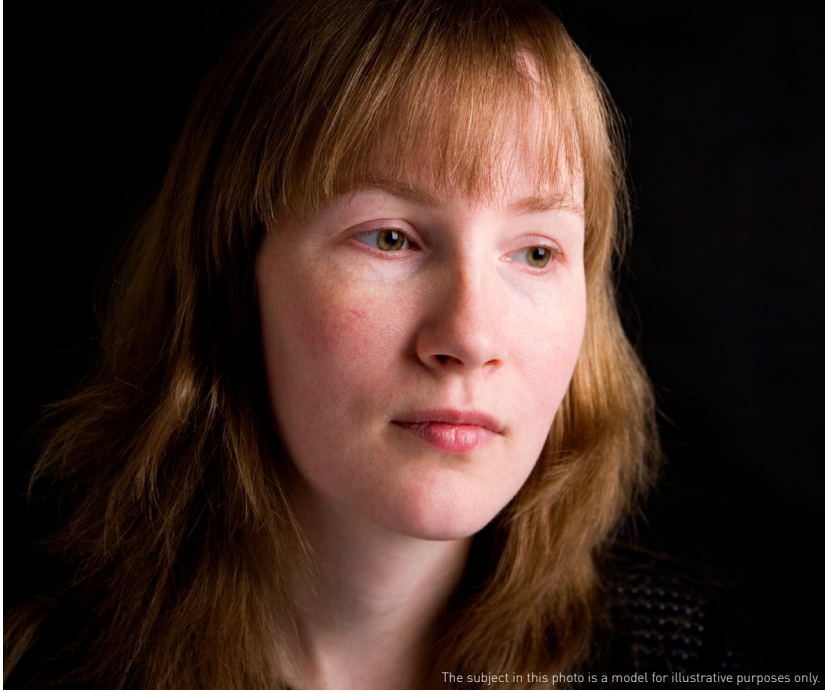
The subject in this photo is a model for illustrative purposes only.

Schizophrenia is a serious mental disorder in which people interpret reality abnormally —resulting in a combination of hallucinations, delusions, and exaggerated or irrational thinking and behavior. Less than one percent of people in the United States suffer from this illness.