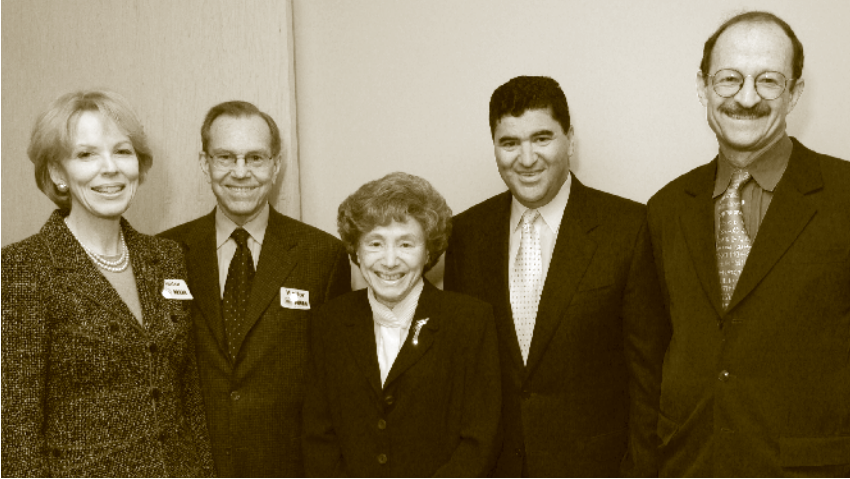
NIH HISTORY OFFICE