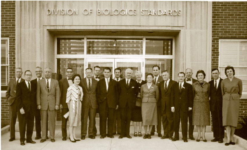
The NIH's DBS welcomed internationally known researchers such as Albert Sabin (11th from left) to polio meetings held on the campus.