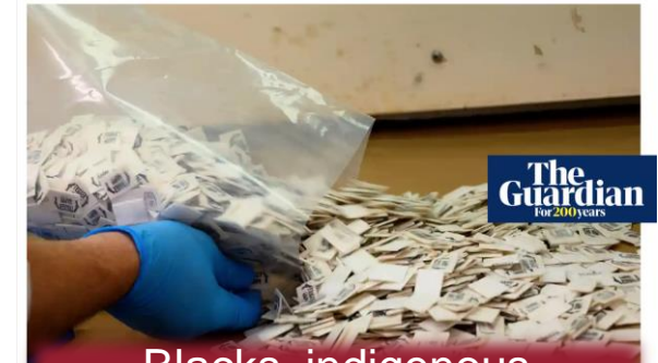
Blacks, indigenous communities are disproportionately harmed

The staggering increase highlights the shifting dynamics and focus of the opioid crisis, long considered a white, rural issue