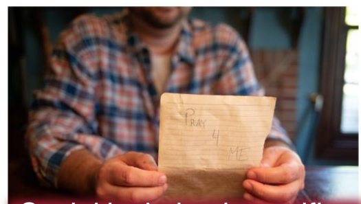
Social isolation intensifies mental health crisis

KERA | By Sujata Dand Published December 14, 2021 at 4:10 AM CST KERA NEWS News for North Texas LISTEN 4:33