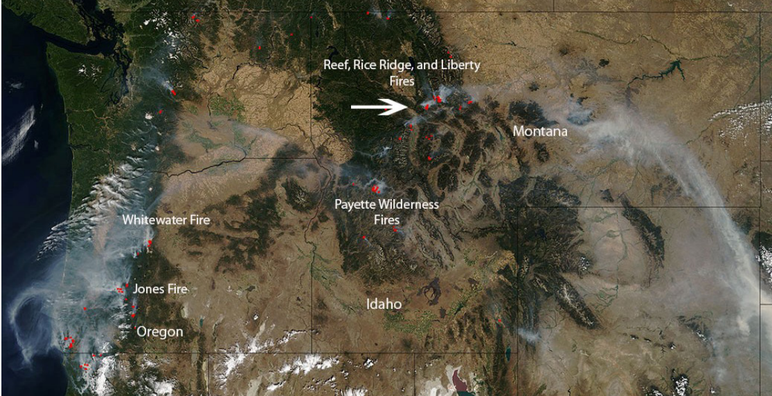
A natural-color image captured by the Moderate Resolution Imaging Spectroradiometer (MODIS) aboard NASA's Terra satellite on August 27, 2017 shows dozens of wildfires burning in the western United States.

In another project, a USGS researcher examined the current understanding of the relationship between wildfire and drought, and recommended key research directions aimed at increasing the usefulness of that knowledge for managing fire risk. 8 Information on how climate conditions and drought influence wildfire over different timescales, along with a greater understanding of how people affect and respond to wildfires in the longer term, could ultimately result in predictions of the timing and size of future wildfires for use in regional planning.