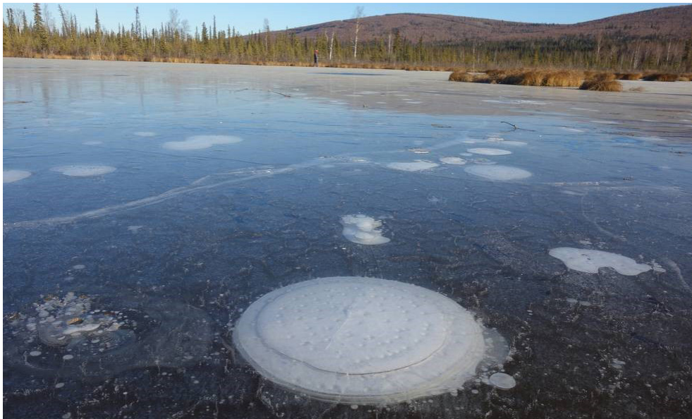
Methane emitted from thawing permafrost below an Arctic thermokarst lake is trapped in bubbles of many different sizes and shapes as the ice grows during the winter.

By comparing estimates of Arctic-wide permafrost carbon emissions from surface thaw alone with estimates that include abrupt thaw beneath thermokarst lakes, researchers found that accounting for emissions from abrupt thaw more than doubles previous estimates of warming caused by northern permafrost thaw this century. These findings demonstrate the need to incorporate abrupt permafrost thaw in Earth system models for a more comprehensive understanding of the rate of climate change throughout the 21st century.