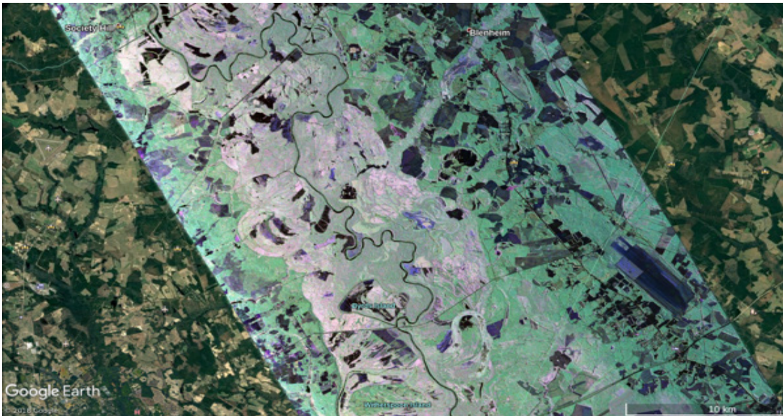
This image of Pee Dee River in South Carolina was captured by NASA's Uninhabited Aerial Vehicle Synthetic Aperture Radar (UAVSAR) instrument aboard a September 17, 2018 science flight. The color composite image shows extensive water inundation, which is visible as various shades of pink pixels, along the present-day river and old river bed across a broad area of 8 to 10 km. Black: flooded ground, smooth bare ground (e.g., roads), or open water (e.g., river). Pink: flooded vegetation. Green: vegetation. Brightness indicates the strength of radar backscatter.