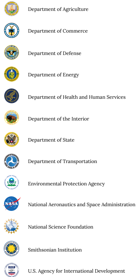
Figure 1: U.S. Global Change Research Program Member Agencies

The Fiscal Year (FY) 2020 edition of USGCRP’s annual report to Congress, Our Changing Planet , presents highlights of the Program’s recent achievements, as well as a summary of agency expenditures under USGCRP’s budget crosscut (see Budgetary Information ), as required by the GCRA. USGCRP’s scope includes but is not limited to the range of agency programs implemented with funds included in the budget crosscut, and the efforts described in this document represent only a small subset of the overall accomplishments of the Program. The highlighted activities represent interagency collaborations that rely on coordinated investments of two or more member agencies. Note that single agency investments, including many that enable interagency accomplishments, are not typically covered in this annual report. See Appendix I. USGCRP Member Agencies for more detail on the principal focus areas related to global change research for each member agency.