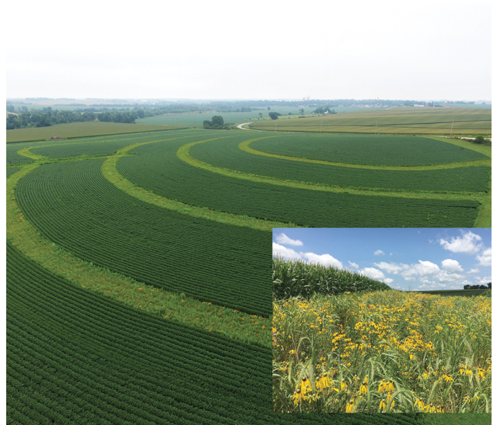
Increasing heavy rains are leading to more soil erosion and nutrient loss on midwestern cropland. Integrating strips of native prairie vegetation into row crops has been shown to reduce soil and nutrient loss while improving biodiversity. The inset shows a close-up example of a prairie vegetation strip. Source: Figure 21.2, Ch. 21: Midwest, NCA4 Volume II (Photo credits: [main photo] Lynn Betts; [inset] Farnaz Kordbacheh).

NCA4 Volume II is available at nca2018.globalchange.gov .