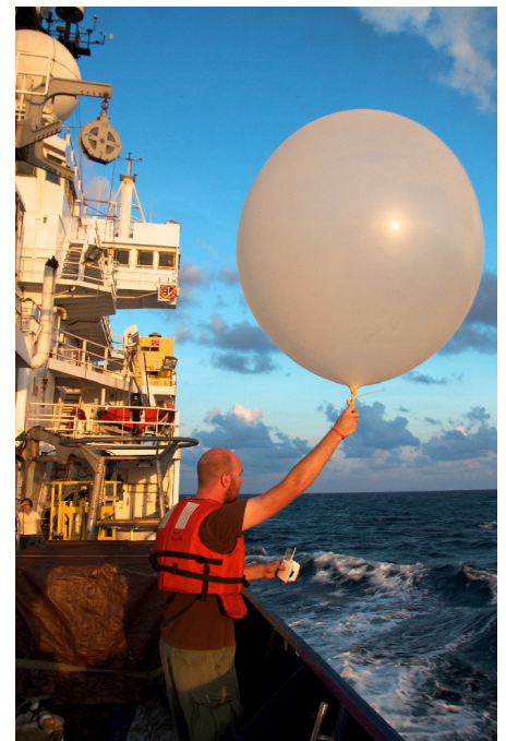
A researcher launches a radiosonde instrument attached to a weather balloon to capture detailed atmospheric data.

In addition to these focused interagency field campaigns, research and operational satellites operated by NASA and NOAA, respectively, provide information on the broader environment in which clouds form beyond the limited time periods of the campaigns. Together, data from focused field campaigns and ongoing satellite operations inform the larger-scale models that simulate Earth's climate system.