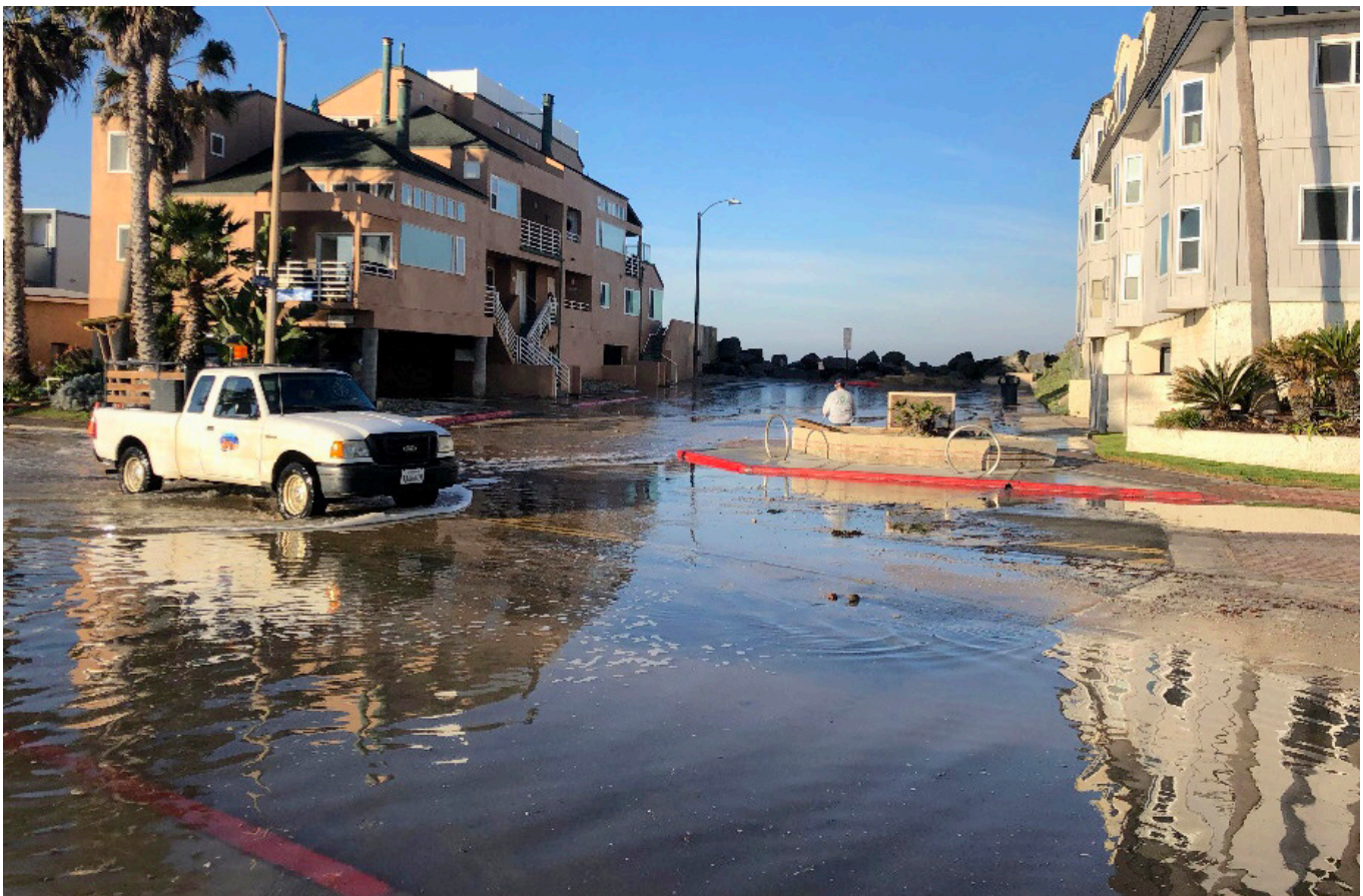
A king tide flooded parts of Imperial Beach, California in December 2018.

Using the new satellite and aircraft data, USGS plans to assess the accuracy of and update flood simulations provided by CoSMoS, which, in turn, will provide better flood hazard forecasts for southern California communities. The updated data are among the resources the California Coastal Commission will use as a guide for identifying areas likely to be affected by flooding and erosion as sea level continues to rise.