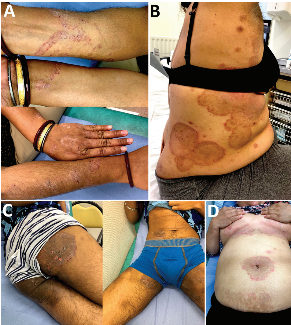
Figure 1. Morphologic features of difficult-to-treat dermatophytosis caused by Trichophyton mentagrophytes complex internal transcribed spacer type VIII ( T. indotineae ) in patients in Paris, France. A) Scaly plaques with erythema and surrounding papulae and vesicles of the arms (patient 1); B) centrifuge annular erythema of the trunk after topical and oral corticosteroids (patient 6); C) erythematous and scaly plaques (patient 3); D) pruritic cutaneous lesions of the groin and axillary pits to which was applied steroids (patient 5).

Thus far, 10 missense mutations in the SQLE gene have been previously proven in vitro to lead to elevated MICs for terbinafine by genetic manipulation (4,13). The F397L and L393S mutations observed in 5 of our patients have been frequently reported in India and Iran (1,2), as well as in Europe among travelers or migrants (3,4,8,10). A448T substitution was observed in 2 patients, for which both isolates had low terbinafine MICs, and 1 of them had high MICs for azoles, as reported elsewhere (3). With the generalization of sequencing, probability of identifying polymorphisms, such as