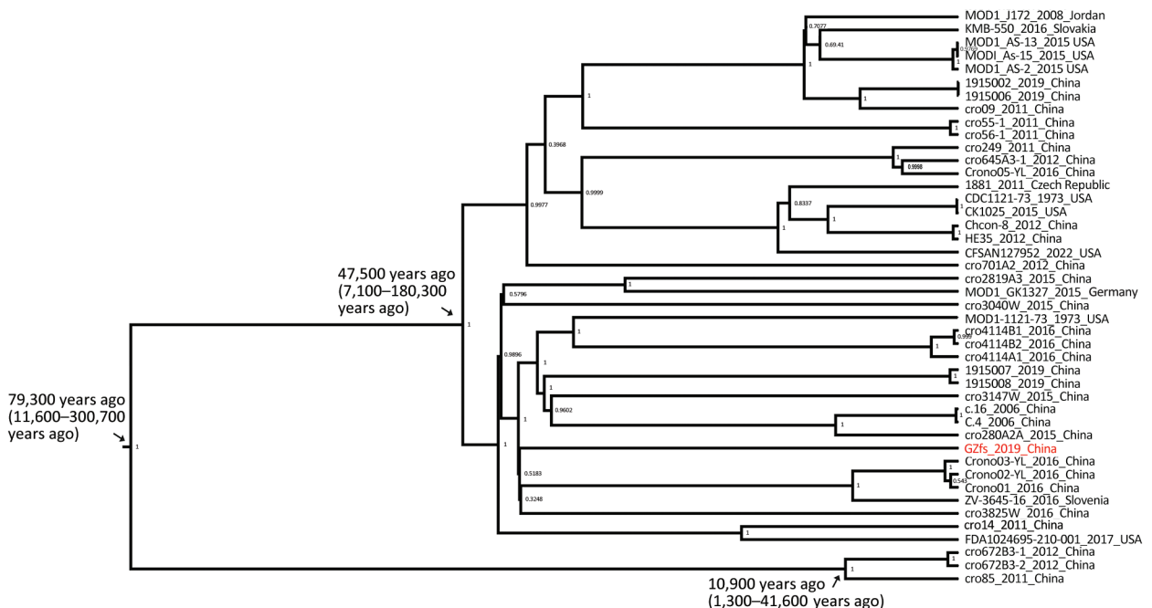
Figure 2. Timed phylogeny in maximum clade credibility tree of Cronobacter sakazakii ST64 strain from a fatal case of necrotizing enterocolitis in a 17-day-old male neonate, China, compared with reference strains. Red text indicates isolate from the neonate. Numbers along branches are bootstrap values. Posterior probabilities are shown in the nodes. ST, sequence type.

The virulence genes in C. sakazakii remain unclear (13), and 2 T6SS and 1 prophage on the chromosome of GZfs might contribute to pathogenicity. The capsular profile of the GZfs was determined to be K1:CA1, as in our previous study (1), and plasmid pFS1 was closely related to the IncFIB-type virulence plasmid pESA3 identified in pathogenic C. sakazakii strains and pGW2 in C. sakazakii GZcsf-1, which causes